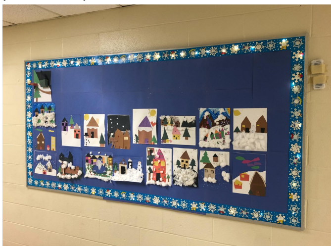
Some of their winter shape villages displayed on a bulletin board, with twinkling lights surrounding them (Visual Arts)