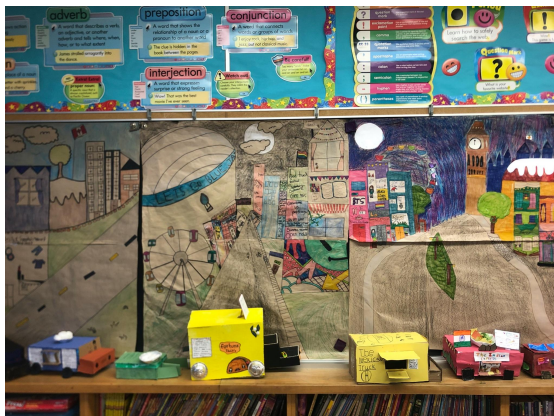
Some of their food trucks displayed in front of a perspective streetscape (Visual Arts)